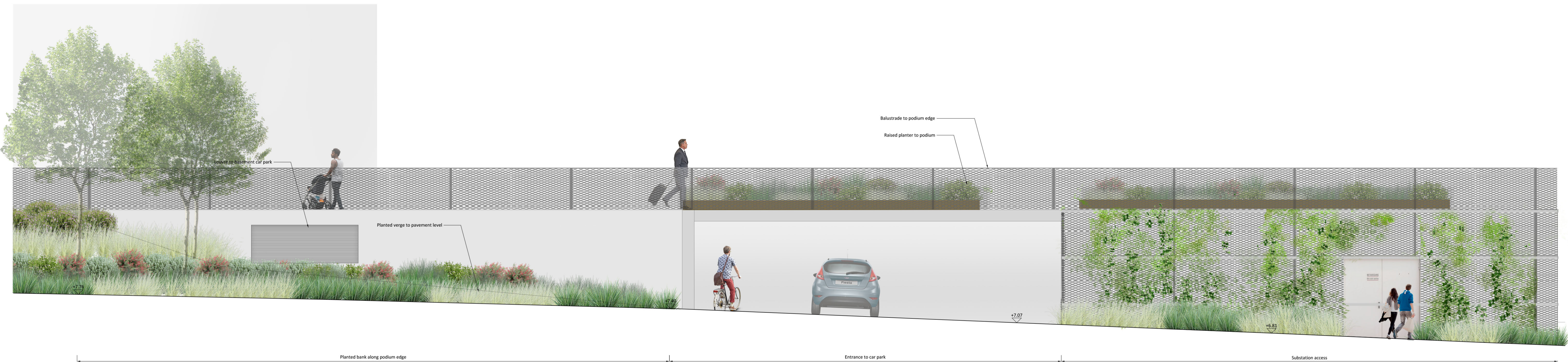
ELEVATION A-A Landscape section along Harton Quay