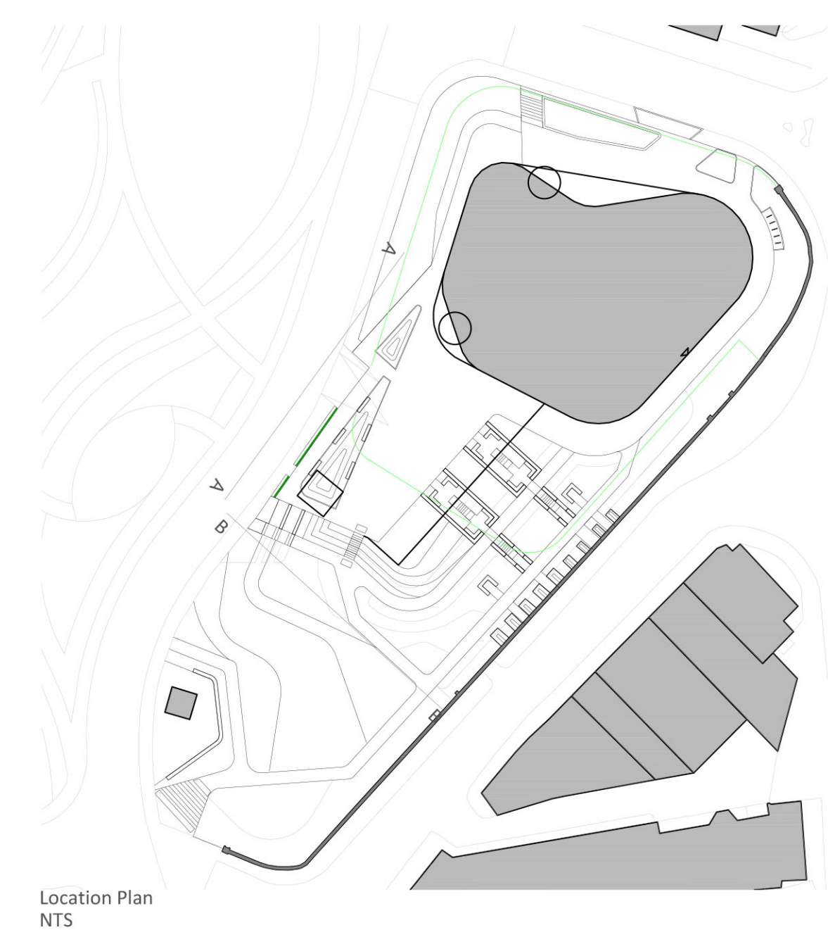
Location Plan NTS